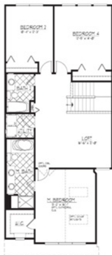
SECOND FLOOR PLAN w/ OPTL. BEDROOM 4