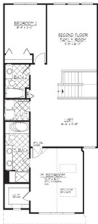
SECOND FLOOR PLAN w/ OPTL. 2nd FLOOR FAMILY