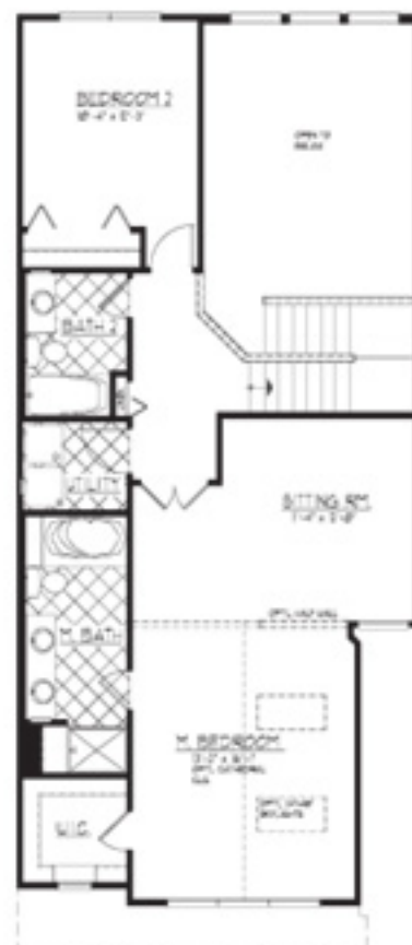
SECOND FLOOR PLAN w/ OPT'L. SUPER SUITE